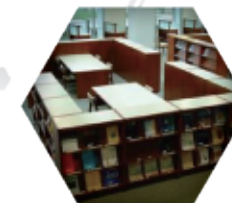
Library and conference room